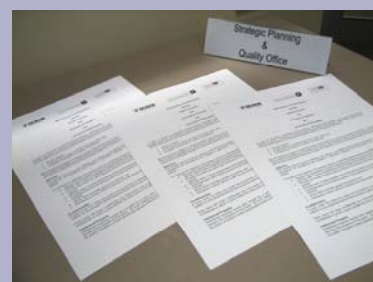
The Memorandum of Understanding between Deakin, UTAS & UOW was signed 13/3/2010.