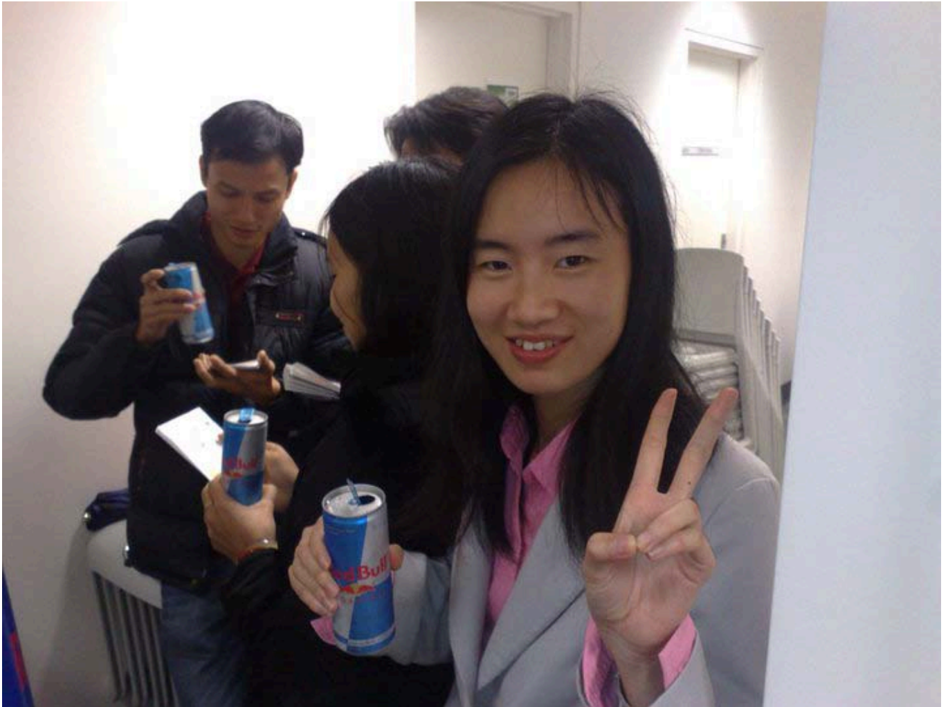
WUPARTY – Wednesday, 28 th July