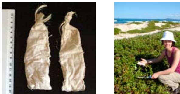
Figure 2: Resin bags (left) and placing resin bags in the sand under bitou bush, Wyrrabalong NP (right)

likely to inhibit native plant growth and create vacant space for more bitou bush to grow.