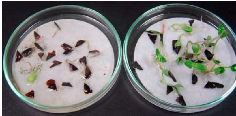
Figure 1: Banksia seedlings grown in bitou bush root hydrophobic extract (Left) and in water (Right)

Although the hydrophobic extract of the coastal wattle roots also affected the seedling growth of some species, there was no comparable effect of the soil extract from under Acacia which suggests that these phytotoxic compounds are not released into the sand and therefore do not have the potential to affect the establishment of native species as the bitou bush root and soil extracts did.