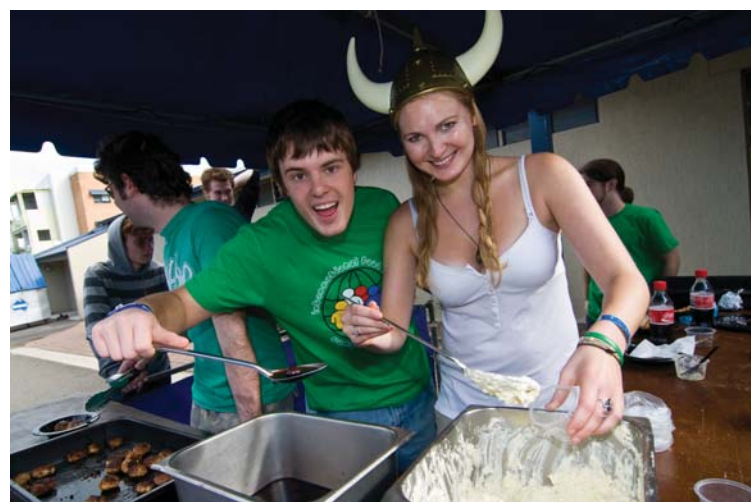
Pictured from top to bottom: Campus East residents enjoy the culinary delights from Yemen and Syria; students from Norway cook up a storm.

UOW Community News is produced by the Office of Community & Partnerships. Your contributions and comments are welcome. Please email community@uow.edu.au or phone 4221 3110.