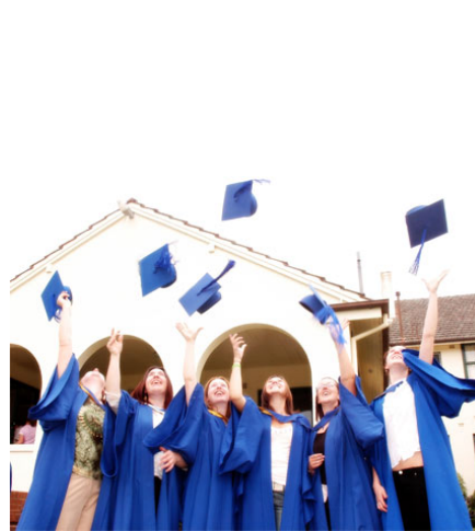
Hats off: Moss Vale graduates celebrate their achievement.