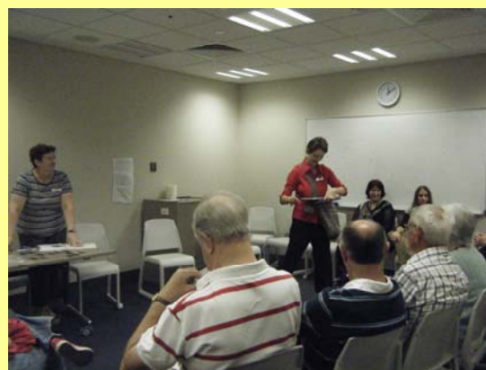
Patient Volunteers preparing for OSCE assessment