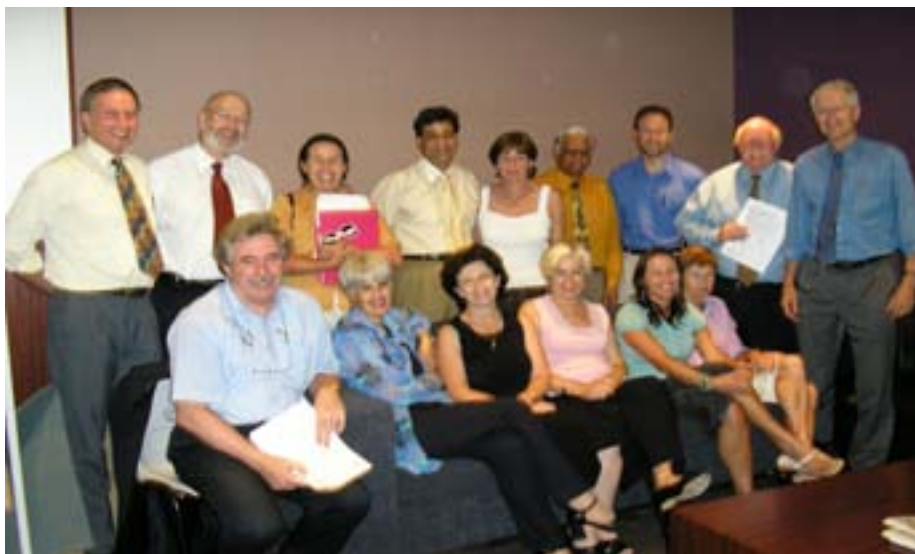
Community ownership of the Medical School was highly rated by the AMC visiting team. The Teaching and Learning Committees of the Shoalhaven and Illawarra were instrumental. Pictured above is the Illawarra Division of General Practice Expert Committee.

Administrative Positions – currently being recruited: