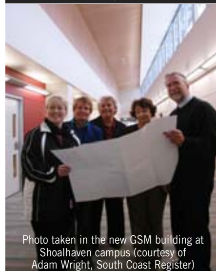
Photo taken in the new GSM building at Shoalhaven campus