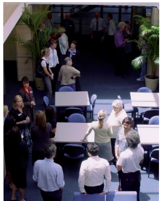
GSM staff "meet the press" in the foyer of the resource centre (Wollongong Campus)