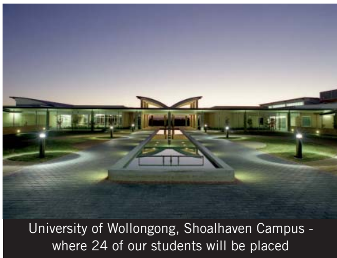
University of Wollongong, Shoalhaven Campus - where 24 of our students will be placed

"The Graduate School of Medicine wishes everyone Season's Greetings and a Happy and Successful New Year"