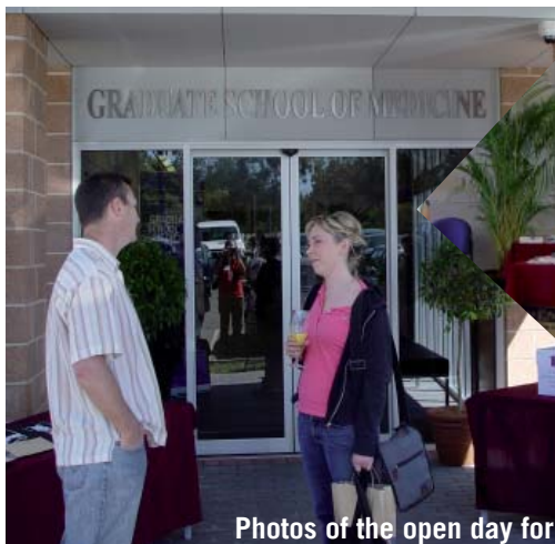
Photos of the open day for prospective