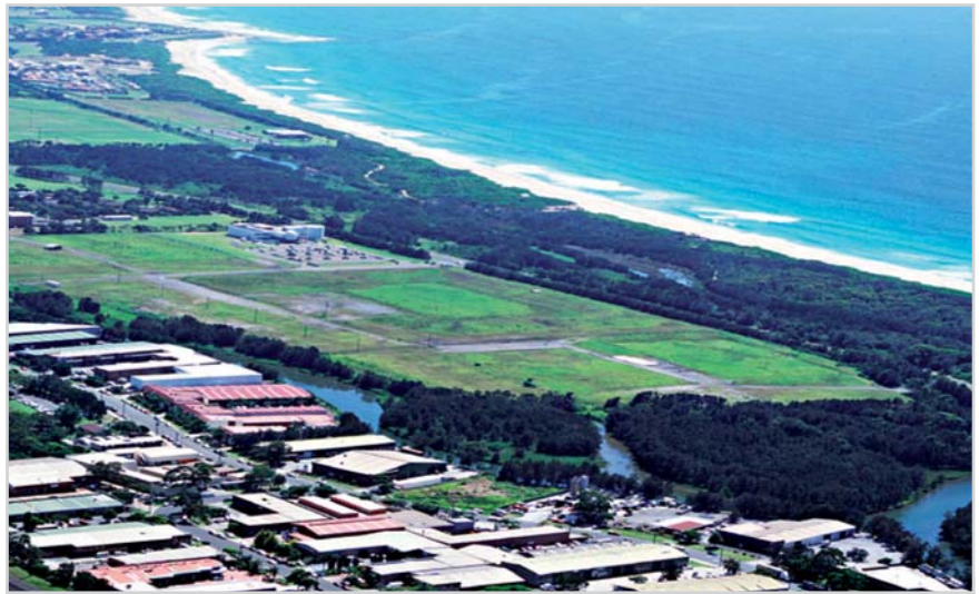
Aerial view of the Innovation Campus site.

Detailed discussions are now underway on the relocation of the GSB from the main campus in Wollongong to the University's innovation campus. A brief on the specification of the GSB's needs is being developed in order to brief the appointed developer and the architect. Subsequent editions of Business Briefing will provide further details.