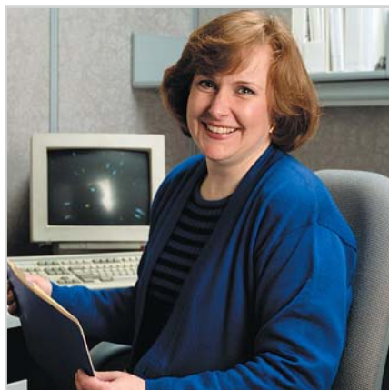
Financial planners may have a greater role to play in helping retirees understand relevant information