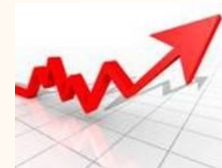
Advancing towards an Integrated Approach