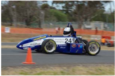
One of UoW Formula's 8 SAE Cars

The Faculty of Engineering at the University of Wollongong takes pleasure in inviting Year 12 ACT Secondary Students, currently studying Design & Technology, to enter the Year 12 ACT 2009 Design & Technology Competition by submitting a Portfolio and Practical Project they have completed in the Major Project Unit.