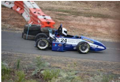
One of UoW Formula's 8 SAE Cars

The Faculty of Engineering at the University of Wollongong takes pleasure in inviting Year 11 ACT Secondary Students, currently studying Design & Technology, to enter the Year 11 ACT 2009 Design & Technology Competition by submitting a Portfolio and Practical Project they have completed this year in any of the 4 Units listed below in the Prizes and Awards Section.