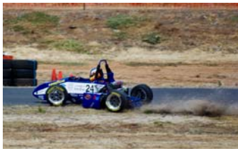
One of UoW Formula's 8 SAE Cars