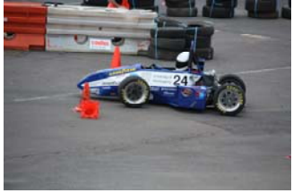
One of UoW Formula's 8 SAE Cars