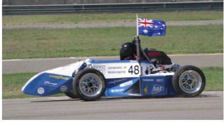
One of UoW Formula's 8 SAE Cars

The Faculty of Engineering at the University of Wollongong takes pleasure in inviting Year 11 Secondary Students currently studying Engineering Studies to enter Engineering Reports they have completed in any of the five (5) Preliminary Course Modules in 2009.