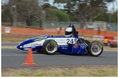
One of UoW Formula's 8 SAE Cars

The Faculty of Engineering at the University of Wollongong takes pleasure in inviting Year 12 Secondary Students, currently studying Design & Technology, to enter the Year 12 2009 Design & Technology Competition by submitting a Portfolio and/or Product they have completed in the HSC Course incorporating an Engineering approach to problem solving.