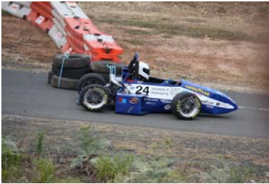
One of UoW Formula's 8 SAE Cars

The Faculty of Engineering at the University of Wollongong takes pleasure in inviting Year 11 Secondary Students, currently studying Design & Technology, to enter the Year 11 2009 Design & Technology Competition by submitting a Portfolio and/or Product they have completed this year in the Preliminary Course incorporating an Engineering approach to problem solving.