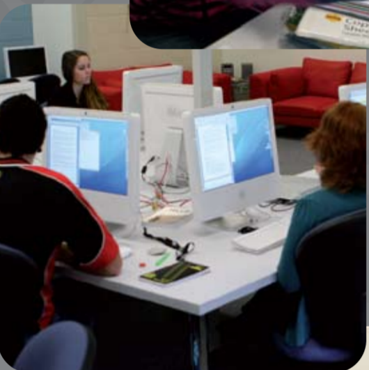
3. editorial hub