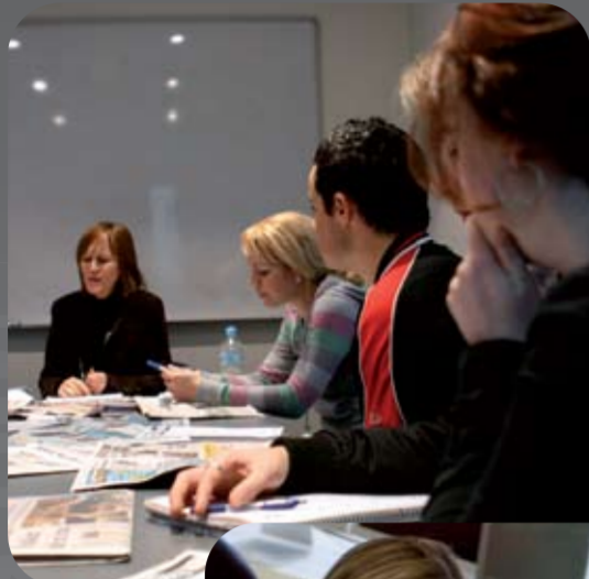
1. editorial conference

Sheridan Burns, Lynette, 2002, Understanding Journalism, London: Sage.