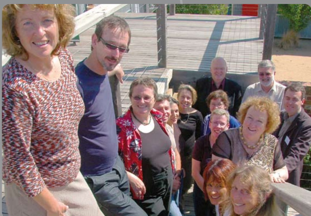
Cross institution networking, collaboration and communication

Distributive leadership is the distribution of power through the collegial sharing of knowledge, of practice, and reflection within the sociocultural context of the university.