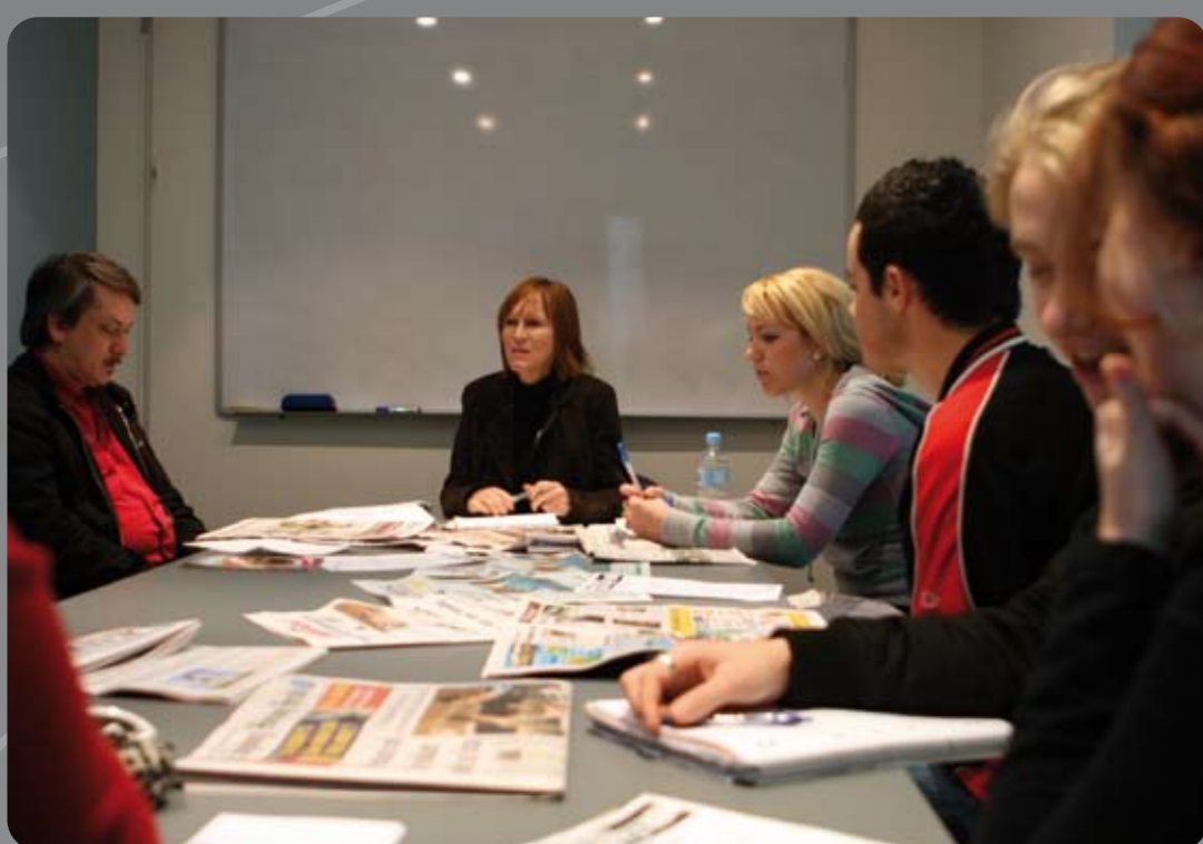
Assessing student learning: Using interdisciplinary synergies to develop good teaching and assessment practice roundtable