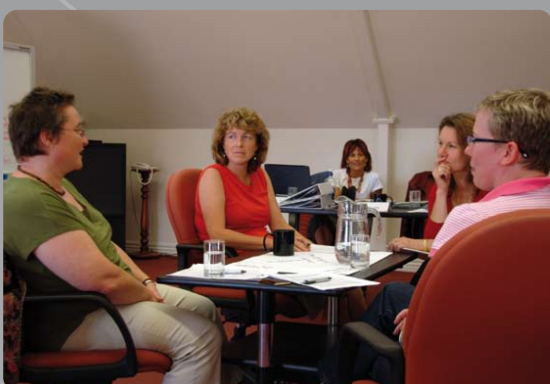
Developing resources to support leadership development and assessment development