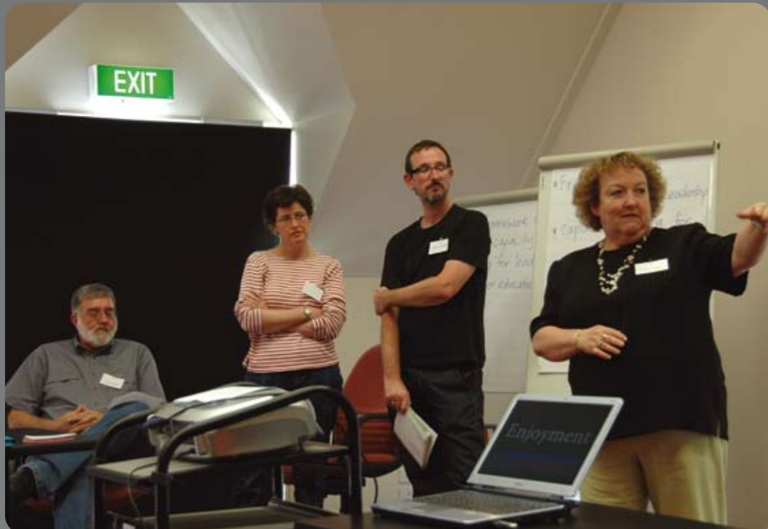
Developing a framework for leadership capacity building in higher education