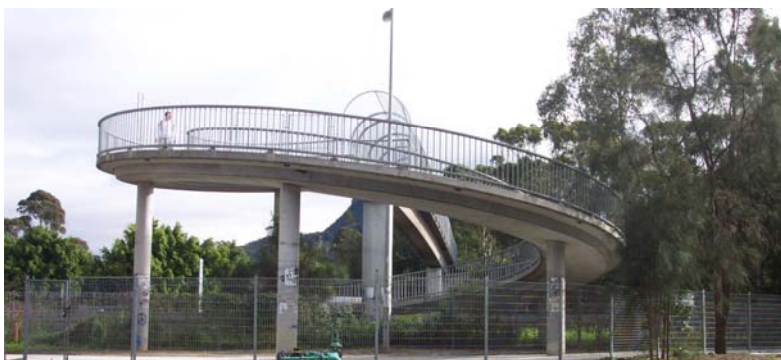
Southern Freeway Overpass

Leave the Northern Distributor cycling lane at the off ramp leading to the cycleway along University Avenue and follow the signs erected by council to the Southern Freeway Overpass. For the return journey it is more pleasant and safer to head north along the path between the Southern Freeway and Wollongong TAFE, from the overpass, exiting onto Lysaght Street. Follow Lysaght Street to its intersection with the Princess Highway, cross the Highway and join the cycling lane heading north on the Northern Distributor