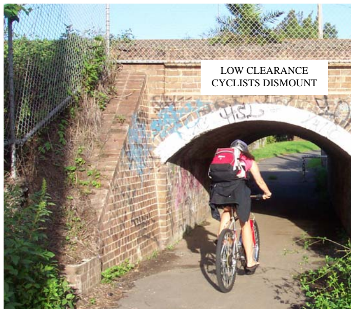
Cycle Underpass at the west end of Smith Street