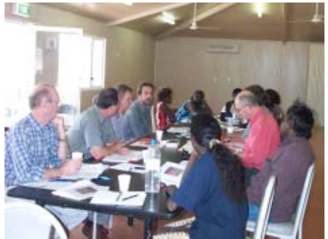
Reference Committee Meeting

A full report on the Meeting will be available at the next meeting to be held in the first week of December.