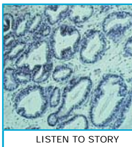
LISTEN TO STORY